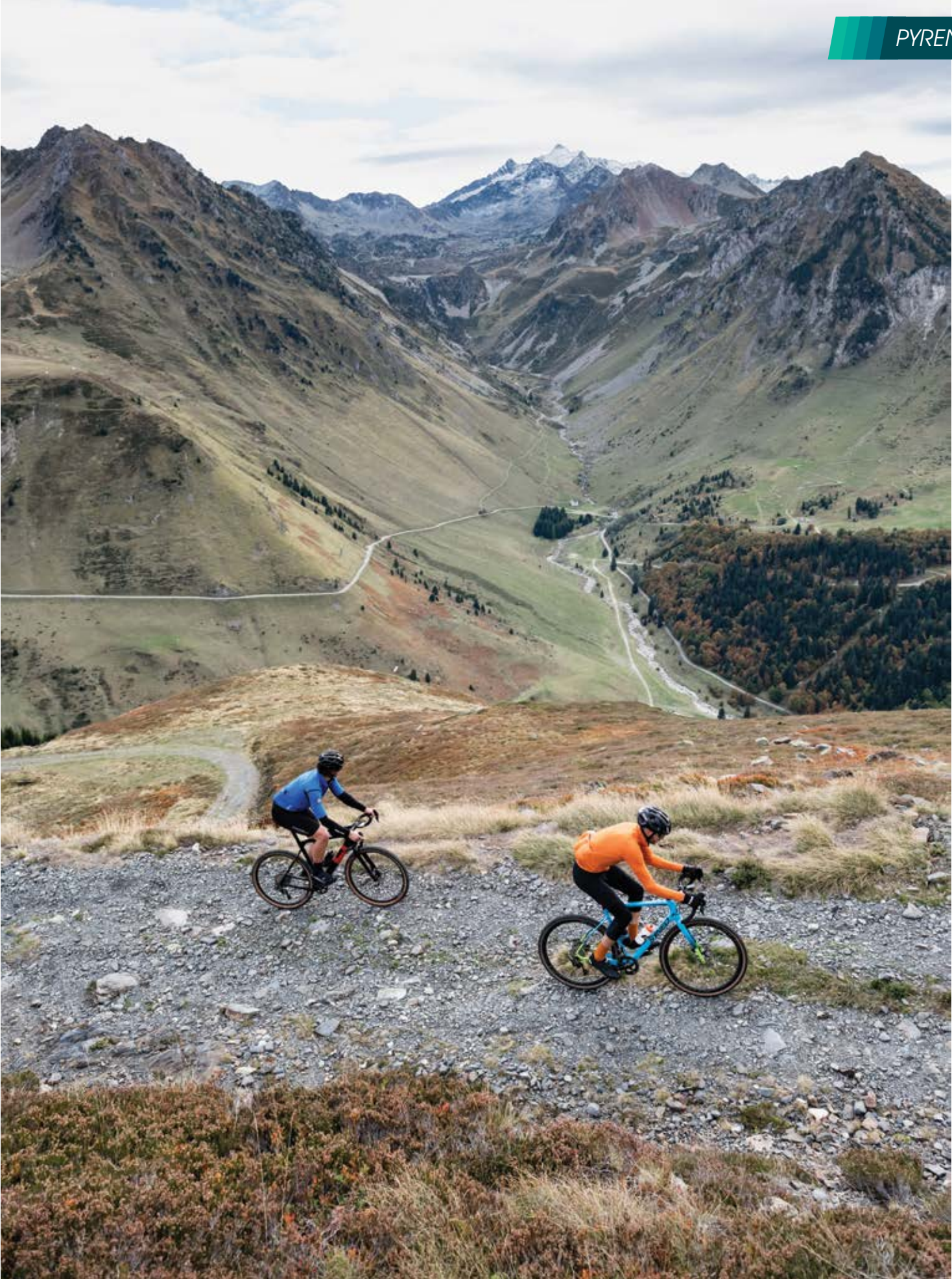
As Off-Road climbs away from Super Barèges on the route's out-and-back, the view is unrestricted across the valley, although the gravel roads we started the day on are all but invisible by now